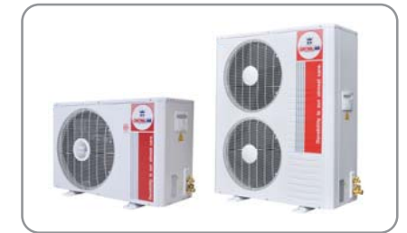
CONDENSING MODEL : CCS-32ES