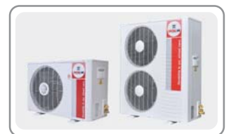
CONDENSING MODEL : CCS-32ES